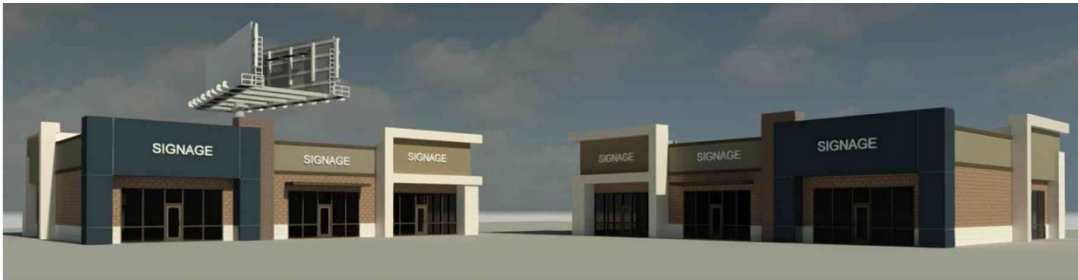
PARKING LOT ELEVATIONS